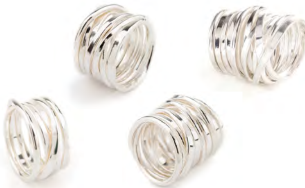
ONEFOOTER, ONEANDAHALFFOOTER, TWOFOOTER, THREEFOOTER Rings Sterling silver

In the same vein, the OneMeter Bangle starts as one meter of thicker sterling silver, which is forged before it is wound into one continuous loop.