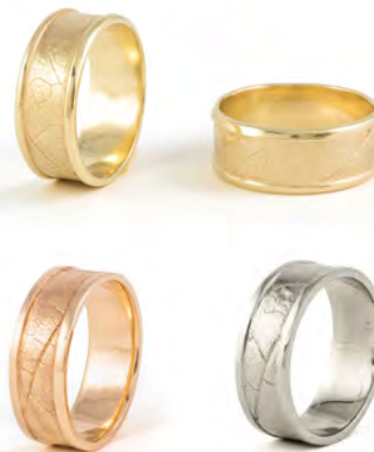
MAPLE LEAF Rings Available in a variety of precious metals