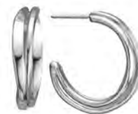
ONEFOOTER Hoop Sterling silver