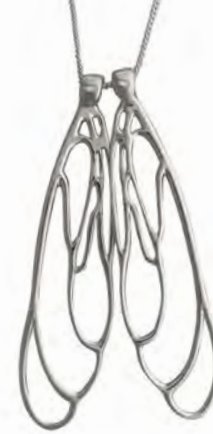
DRAGONFLY Necklace Sterling silver