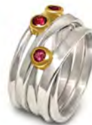
ONEFOOTER Ring Sterling silver, spinel in 18kyg