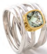
ONEFOOTER Ring Sterling silver, prasiolite in 18kyg