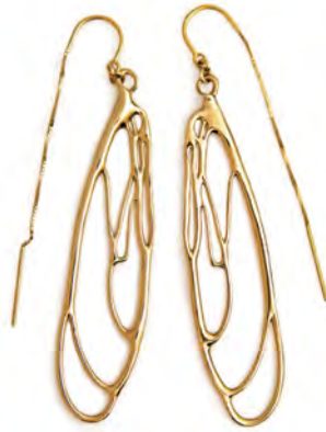
DRAGONFLY Earrings 14k gold

Each wing component is just under 6 cm or 2.25 inches in the pendant and the long earrings, and just under 4 cm or 1.5 inches for the short version