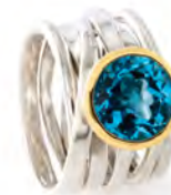
ONEFOOTER Ring Sterling silver, blue topaz in 18kyg

*Each piece is one-of-a-kind. RESULTS VARY.