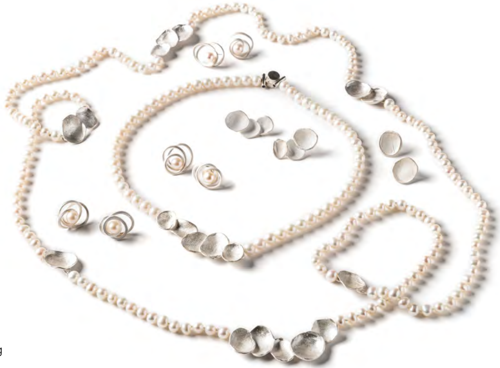
MOONPEARL Series Sterling silver, freshwater pearls

There are several earrings in this series. MoonShell One and MoonShell Three have one or three such shells/prints, respectively. The MoonPearl Swirl earrings are inspired by constellations. Their dreamy elegance comes from letting the sterling wire guide me as much as I am guiding it when I create each one of these. This design continues my study of line, and my commitment to making pieces individually by hand.